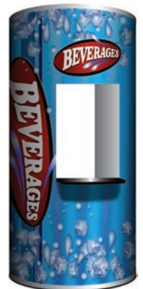
Sample artwork on assembled BrandBooth

Reusable hard plastic shipping case with wheels and handle.